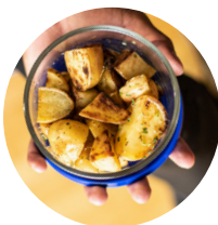
PRE-SEASONED MICROWAYABLE POTATOES

Encourage your athletes to use these time and energy-saving fueling staples: