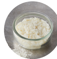
DEHYDRATED POTATO FLAKES