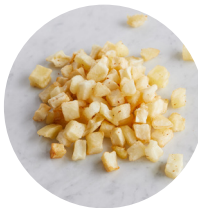
FROZEN, PRE-DICED POTATOES